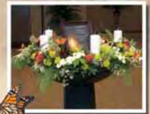
Our exclusive candle lighting ceremony encourages us to continue to remember our loved ones who have gone before us.