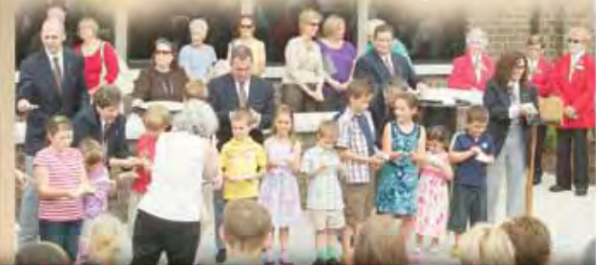
Children were thrilled to assist us with our touchingly symbolic Butterfly Release.