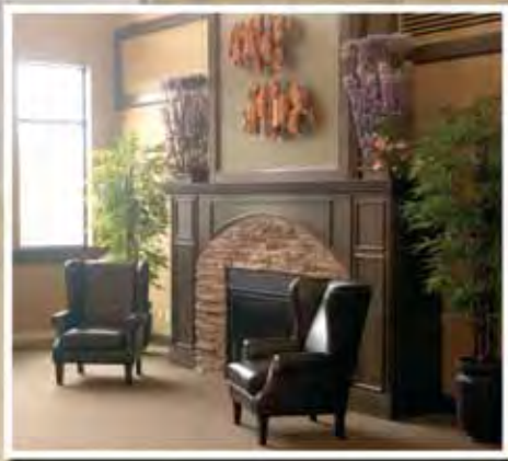
The new Banwell Chapel is very spacious, yet has a warm, welcoming feel.